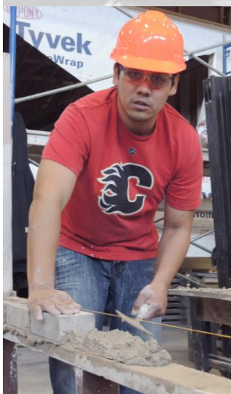
Kelly Burns

We have just launched our new Pinterest board. Pinterest allows you to 'pin' images to your online board that interest you, pretty much in the same way as you would use a cork board. We have added a plug-in to the website that allows a 'Pin It' link to be displayed when you hover over a shop item. Our Pinterest account is available at http://www.pinterest.com/gabrielumontin/