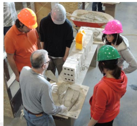
GED Apprenticeship students and their Masonry instructor, March 2015